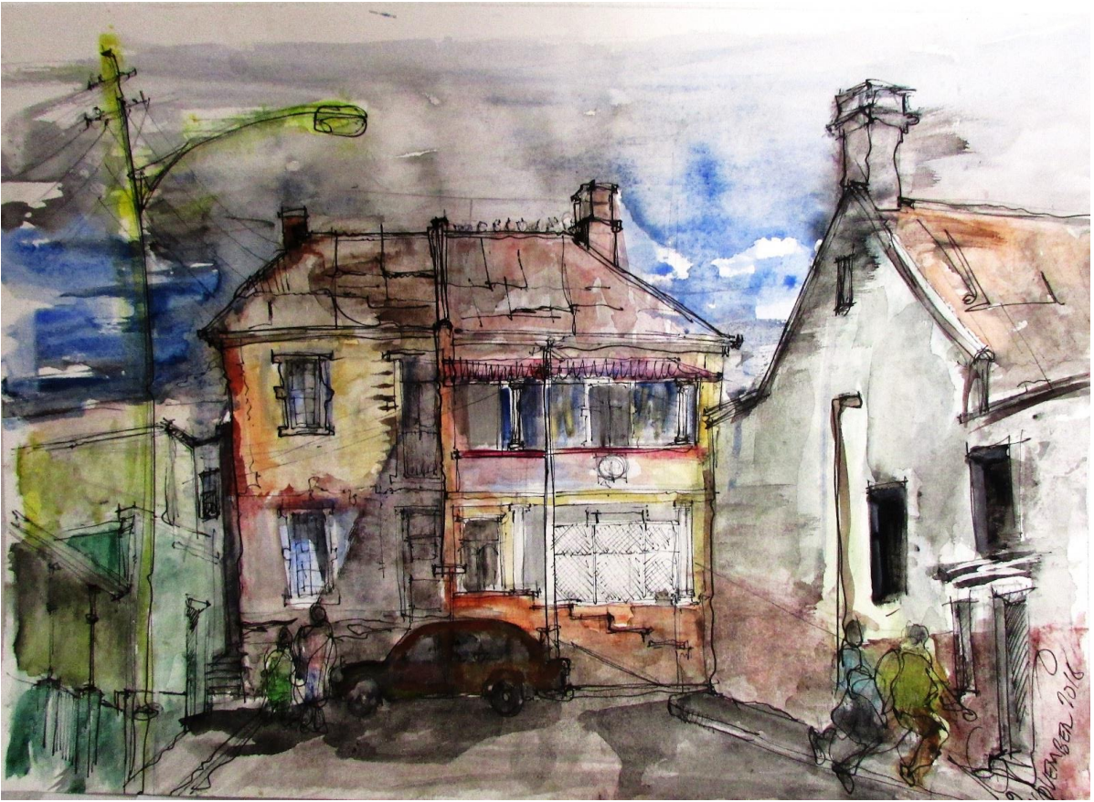
Bryant Street, District Six, Cape Town