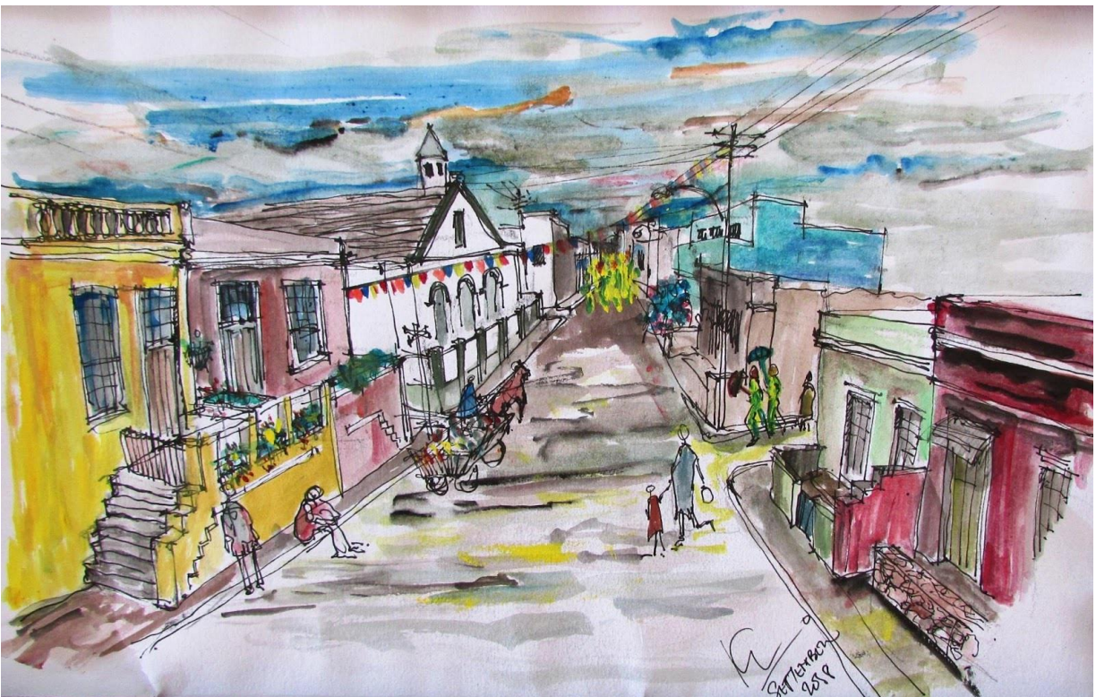
Days gone by in Chiappini Street, Bo-Kaap