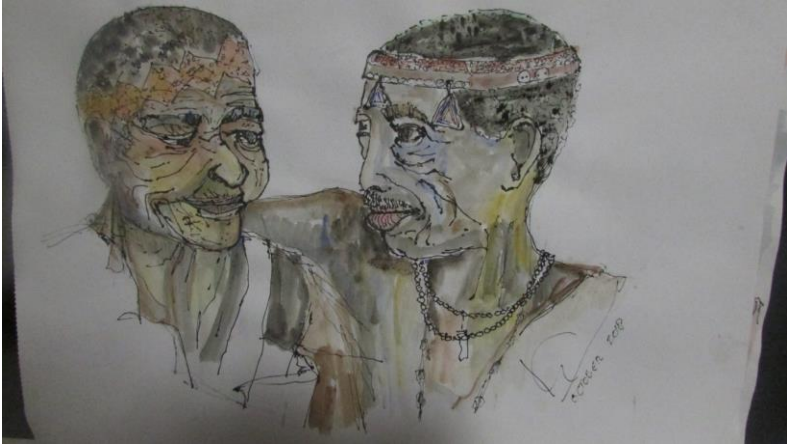
An elderly Khoi couple