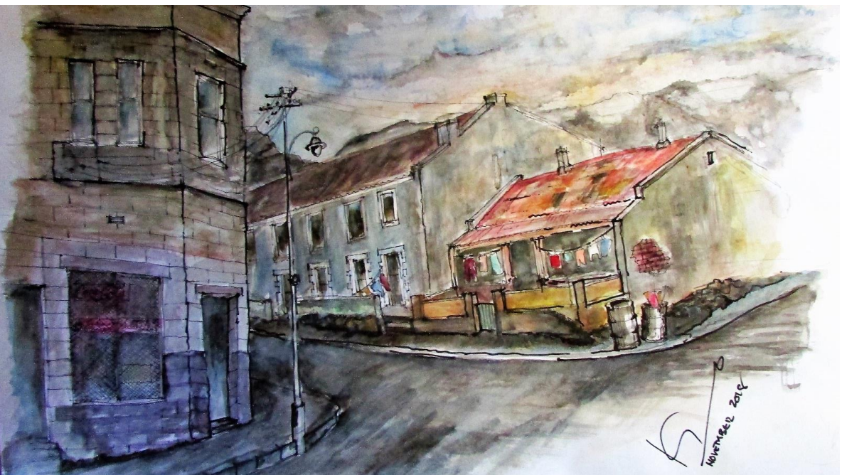
Corner of McKenzie & Sackville St, District Six