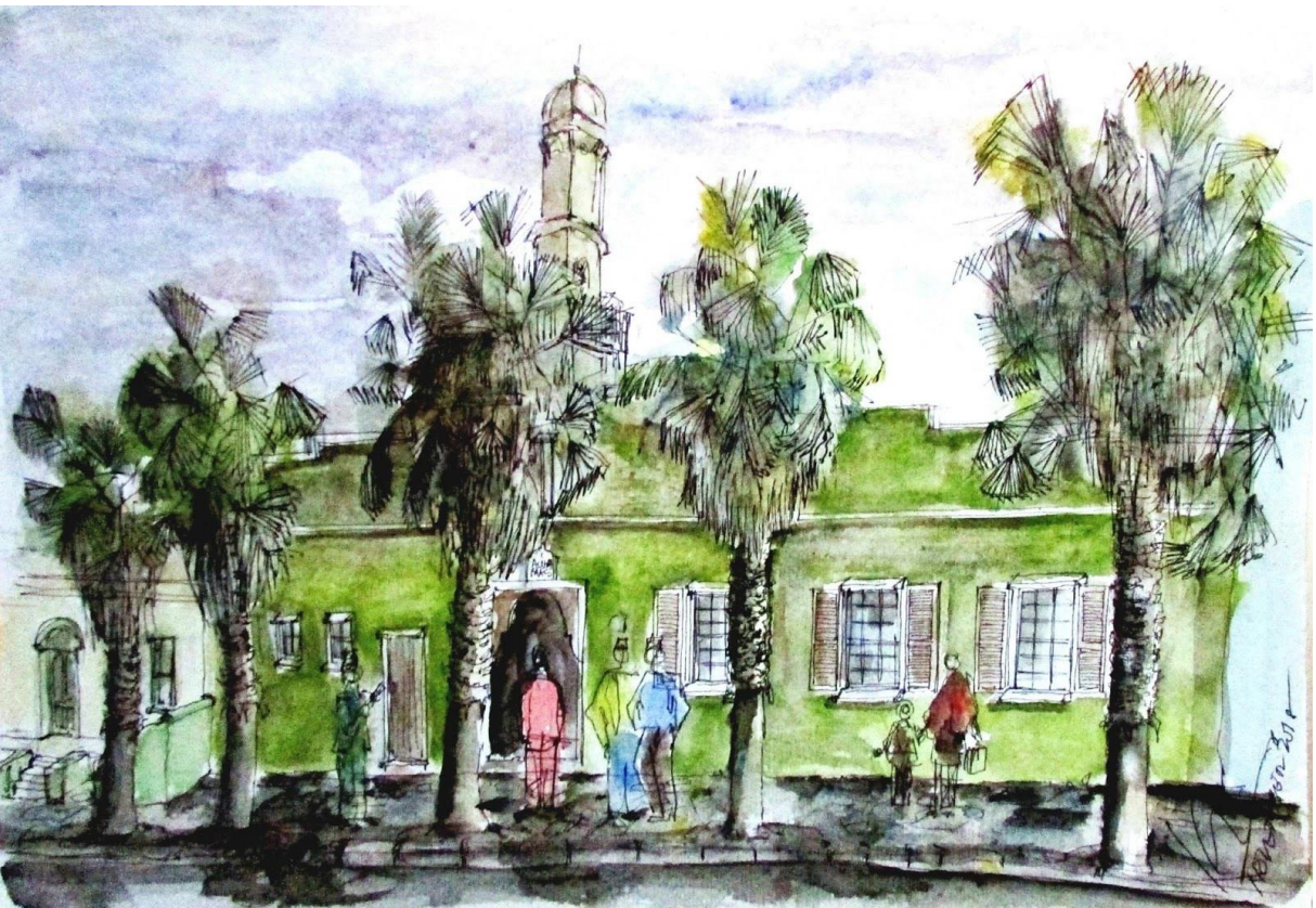
Auwal Mosque, Bo-Kaap, Cape Town