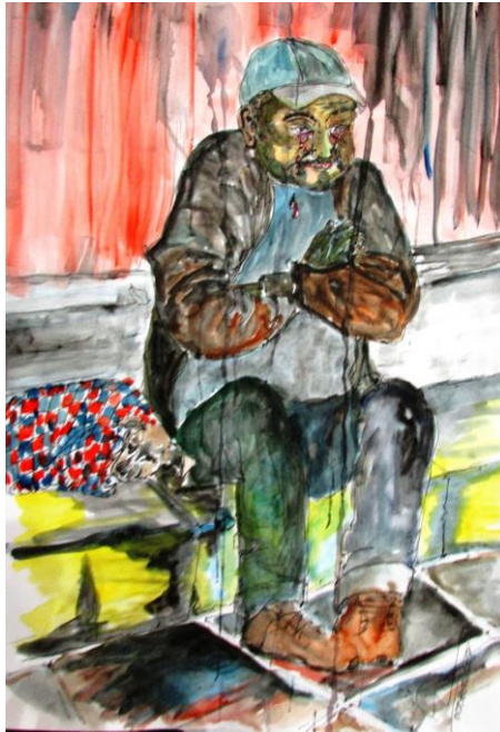
A man, a dog and the elements