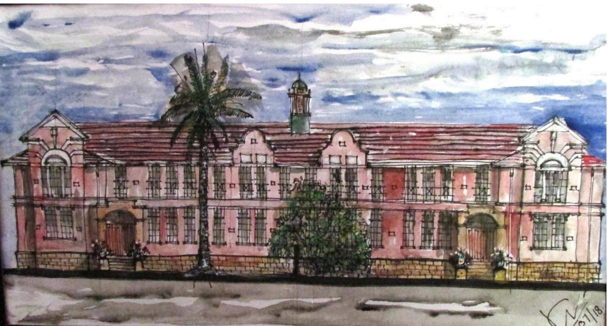
Chapel Street Primary School for Boys & Girls, Cape Town