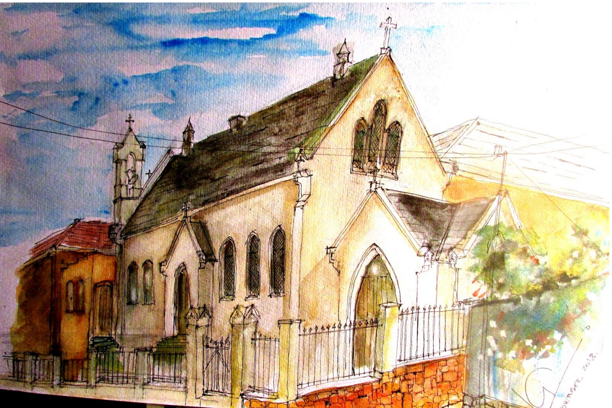
Holy Cross Catholic Church, District 6, Cape Town