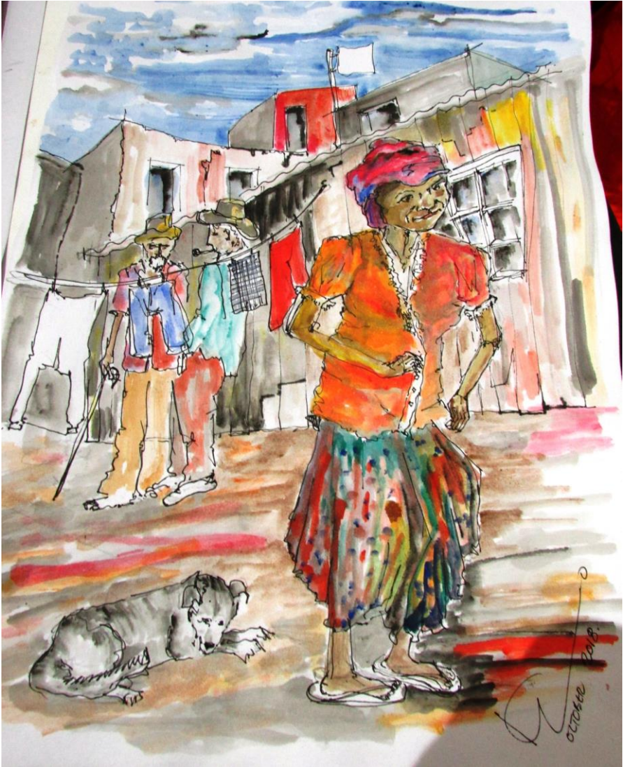
Antie doing the Riel dance