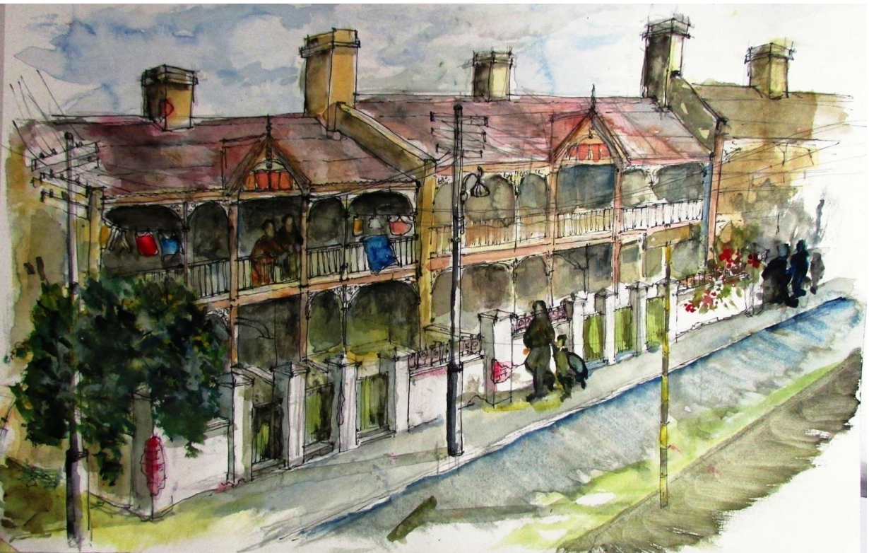
St Vincent Street, District Six, Cape Town