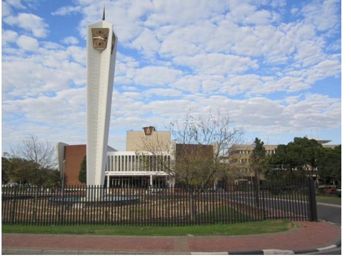
Figure 8: "Bellville Civic Centre". 30 May 2016.

The Civic Centre, the cultural hub of Bellville and located on Voortrekker Road, ushered in an added facet of the growth and