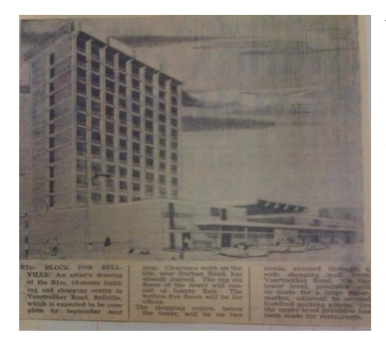
Figure 7: Cape Times, 1967, Bel 13, The Masterson Collection, Special Collections, Bellville Library.

Today, economic pursuits in Voortrekker Road are seen on a much smaller scale, and are much less formal. These are apparent in the diverse shops and businesses in Voortrekker Road, Bellville; from R5 stores to internet cafes, barber shops and salons, fast-food stores and market stalls. This contrast makes for an interesting aesthetic and thus validates my impressions. An aesthetic of vast and various colours, designs, modern and archaic, and buildings of diverse shapes, large and small.