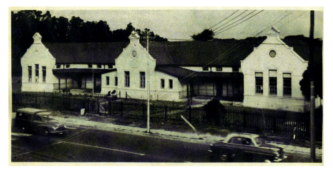
Figure 10: C. J. Scheepers Strydom, Bellville: Wordingsjare van 'n Stad – Growth of a City. Bellville: Stadsraad van Bellville, 1981, p. 69.

What was once a school, is now a police department—this is truly a testament to Bellville and Voortrekker Road's transformation. Since the very first initiative to make public schooling an added element of Bellville's development, public schooling has become widespread. Municipal statistics of the 1970s convey the presence of six primary schools and three high schools for the White population - they also state the existence of three primary schools for non-whites and one high school.<sup>29</sup>