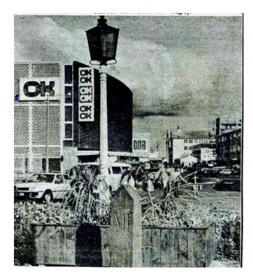
Figure 3: Die Burger, 19 October 1987. (Masterson Collection)

Before 'Twaalf Myl', the unofficial name for the small village, was named Bellville, by 1859 it was afforded the name D'Urban Road.