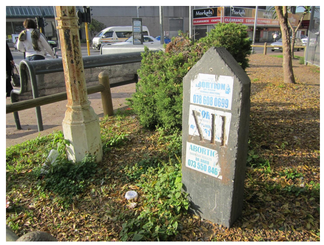
Figure 5: "Milestone". 30 May 2016.

The buildings around the milestone are a testament to the growth and development of Bellville and Voortrekker Road. One can only imagine the extent to which the milestone's significance as a historical monument has diminished, due to being overshadowed by development, since the quote was expressed in Die Burger in 1984. Bellville and Voortrekker Road have indeed transformed themselves since their inception.