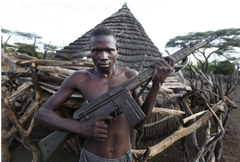
Fighter in Sudan.