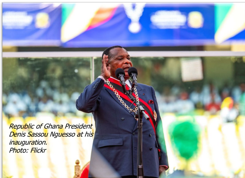
Republic of Ghana President Denis Sassou Nguesso at his inauguration.

17 March: President Denis Sassou Nguesso (82) of the Republic of the Congo won a fifth consecutive term, with 95% of the vote, in the 2026 presidential election. He is the third longest ruling leader in Africa, behind President Teodoro Obiang Nguema (83) of Equatorial Guinea and President Paul Biya (93) of Cameroon.