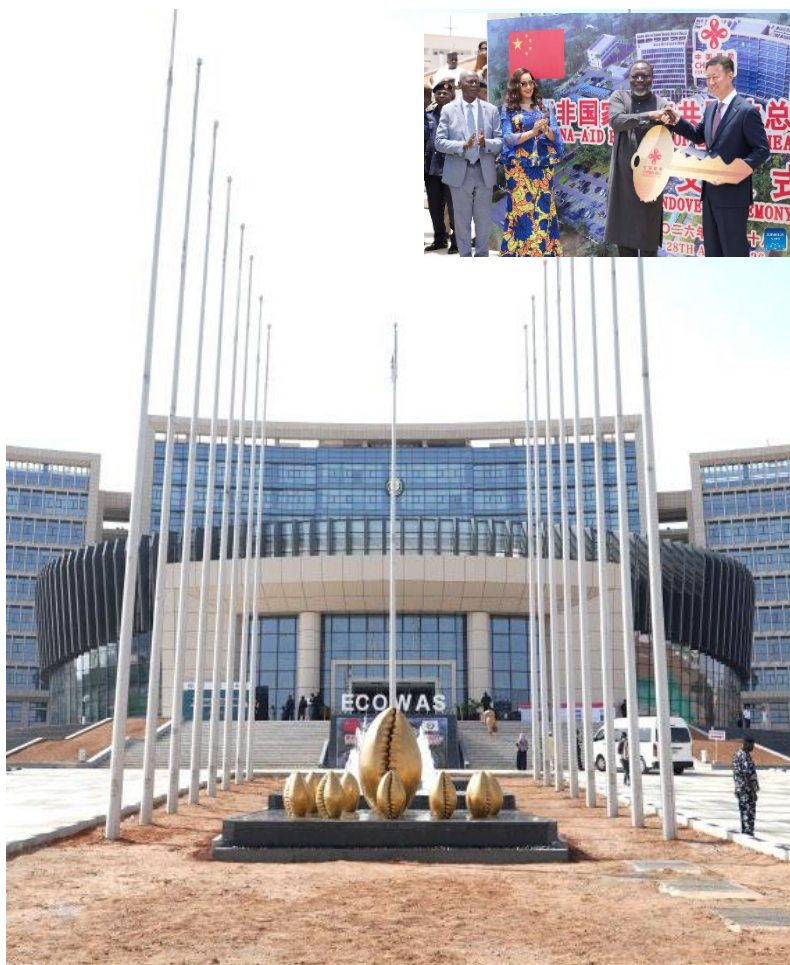
A view of the newly completed ECOWAS headquarters in Abuja, Nigeria. Top right: Chinese Ambassador to Nigeria Yu Dunhai and the ECOWAS Commission President, Omar Touray, at the handover ceremony on 28 April 2026.

the digital age,” the previous RightsCon summit in 2025 was held in Taipei, Taiwan. Taiwan ranks 28 on the Reporters Without Borders (RSF) World Press Freedom Index. Zambia is number 77 and China 178 (third last). The venue for the conference was refurbished by Chinese contractors in 2022. The Chinese Ambassador to Zambia, Li Jie, stated at the time that China would assist Zambia to hold international events.