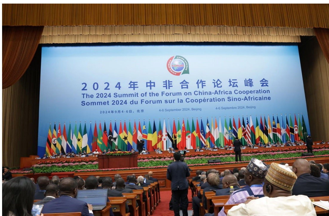
President Cyril Ramaphosa at the podium at FOCAC