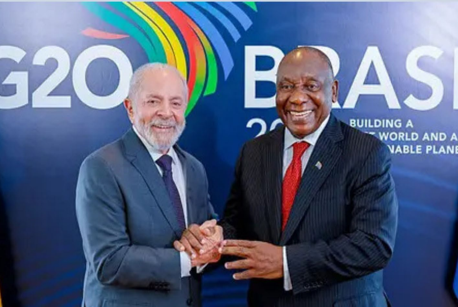
Brazilian President Lula da Silva with President Ramaphosa at the handover of the G20 presidency at the end of the summit in Rio de Janeiro