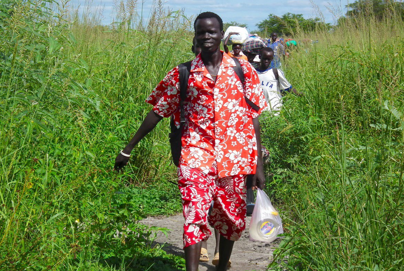
Refugees in Sudan