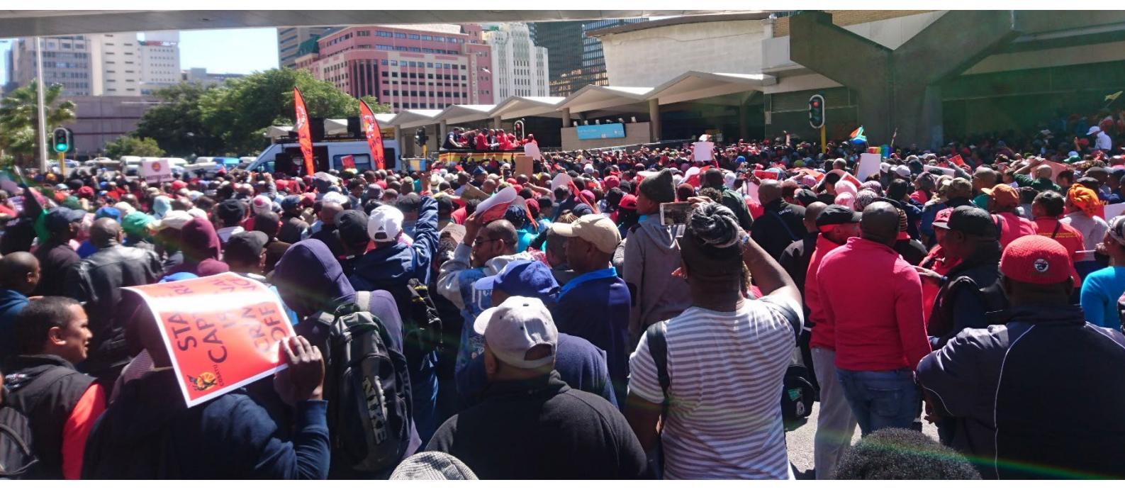
Congress of South African Trade Unions (Cosatu) protest against state capture

It is in the nature of Mbeki's explanation that the best evidence which he is able or willing to present is purely circumstantial and so we are left with the assurance that 'time will tell' whether his 'logical deductions' are correct.