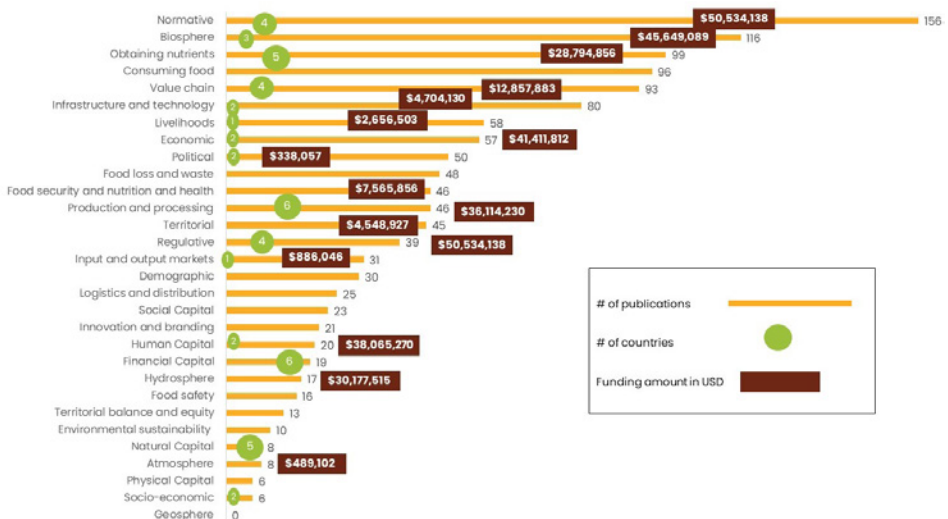
Figure 3: Results summary of the alignment between research publications, policy prioritisation in the six countries and research funding

Figure 3 presents a summary of the collated results looking at gender and food systems research publications, policy priorities and research funding in the six countries.