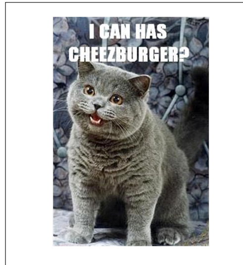
Figure 5: I can has cheezburger?

The opposite can also apply, certainly when memes are widely known because of textual- stylistic features: the actual ways in which ‘ linguaging ’ is performed through fixed expressions and speech characteristics. A particularly successful example of such textual- stylistic memicity is so-called ‘ lolspeak ’, the particular pidginized English originally associated with funny images of cats (‘ lolcats ’), but extremely mobile as a memic resource in its own right. Consider figures 5, 6, and 7. Figure 5 documents the origin of this spectacularly successful meme: a picture of a cat, to which the caption ‘I can has cheezburger?’ was added, went viral in 2007 via a website ‘I can has cheezburger?’. The particular caption phrase went viral as well and became tagged to a wide variety of other images – see figure 6. The caption, then, quickly became the basis for a particular pidginized variety of written English, which could in turn be deployed in a