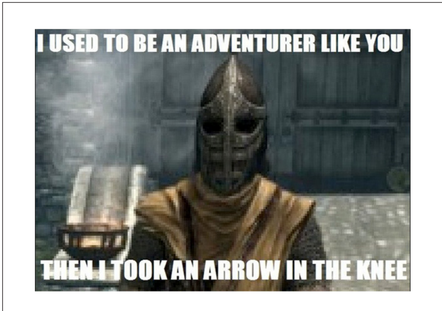
Figure 9: Skyrim scene ‘Then I took an arrow in the knee’. See http://knowyourmeme.com/memes/i-took-an-arrow-in-the-knee .

to addressees and audiences, and degrees of intervention in the original signs. The procedures we have reviewed here differ in degree but not in substance: they are, like ‘retweets’, ‘likes’ and ‘shares’, re-entextualizations of existing signs, i.e. meaningful communicative operations that demand different levels of agency and creativity of the user. Second, and related to this, the nature of the original sign itself—its conventionally understood ‘meaning’—appears to be less relevant than the capacity to deploy it in largely phatic, relational forms of interaction. This again, ranges from what Malinowski described as ‘communion’—ritually expressing membership of a particular community—to ‘communication’ within the communities we described as held together by ‘ambient affiliation’. ‘Meaning’ in its traditional sense needs to give way here to a more general notion of ‘function’. Memes, just like Mark Zuckerberg’s status updates, do not need to