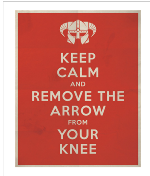
Figure 8: Keep calm and remove the arrow from your knee

See https://www.facebook.com/pages/Keep-Calm-and-remove-the-arrow-from-your-knee/254461191300457 .