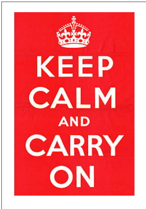
Figure 2: British wartime propaganda poster

In figures 2, 3, and 4 we see how one set of affordances—the visual architecture of the sign and its speech act format—becomes the intertextual link enabling the infinite resemiotizations while retaining the original semiotic pointer: most users of variants of the meme would know that the variants derive from the same ‘original’ meme. The visual architecture and speech act format of the ‘original’, thus, are the ‘mobile’ elements in memicity here: they provide memic-intertextual recognisability, while the textual adjustments redirect the meme towards more specific audiences and reset it in different frames of meaning and use.