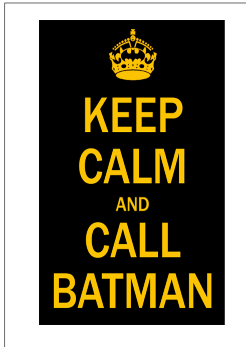
Figure 3: Keep calm and call Batman

See http://knowyourmeme.com/memes/keep-calm-and-carry-on for figures 2-4