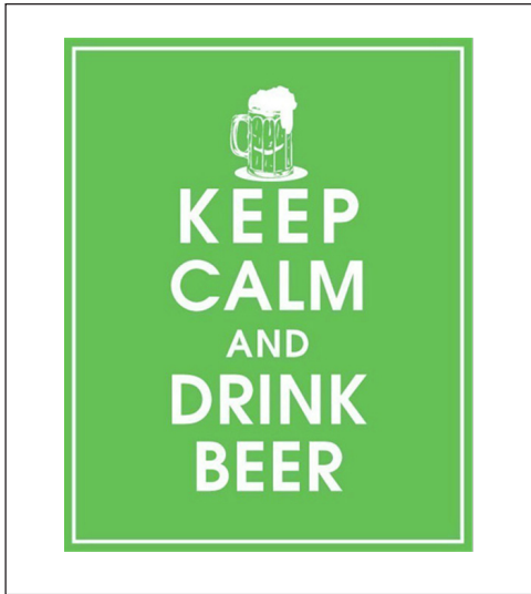
Figure 4: Keep calm and drink beer

The opposite can also apply, certainly when memes are widely known because of textual- stylistic features: the actual ways in which ‘ linguaging ’ is performed through fixed expressions and speech characteristics. A particularly successful example of such textual- stylistic memicity is so-called ‘ lolspeak ’, the particular pidginized English originally associated with funny images of cats (‘ lolcats ’), but extremely mobile as a memic resource in its own right. Consider figures 5, 6, and 7. Figure 5 documents the origin of this spectacularly successful meme: a picture of a cat, to which the caption ‘I can has cheezburger?’ was added, went viral in 2007 via a website ‘I can has cheezburger?’. The particular caption phrase went viral as well and became tagged to a wide variety of other images – see figure 6. The caption, then, quickly became the basis for a particular pidginized variety of written English, which could in turn be deployed in a