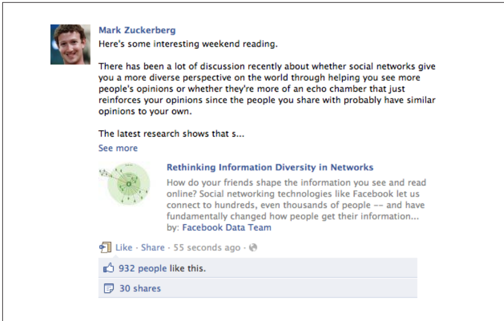
Figure 1: Screenshot of Zuckerberg's status update on Facebook, January 21, 2012

are further and further levels of uptake, as other users witness this liking and sharing activity (some of it may already be showing in the figures here), and consequently make inferences about the meaning of the post itself, but also about the person(s) in their network who reacted to it. Further layers of contextualisation are thus added to the original post, which may have an influence on the uptake by others.