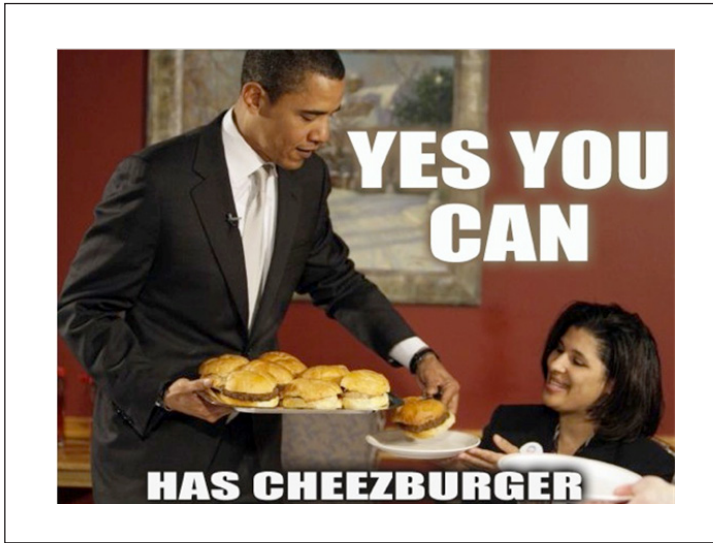
Figure 6: President and a possible voter having cheezburger.

See http://www.myconfinedspace.com/2008/04/18/barack-obama-yes-you-can/ .