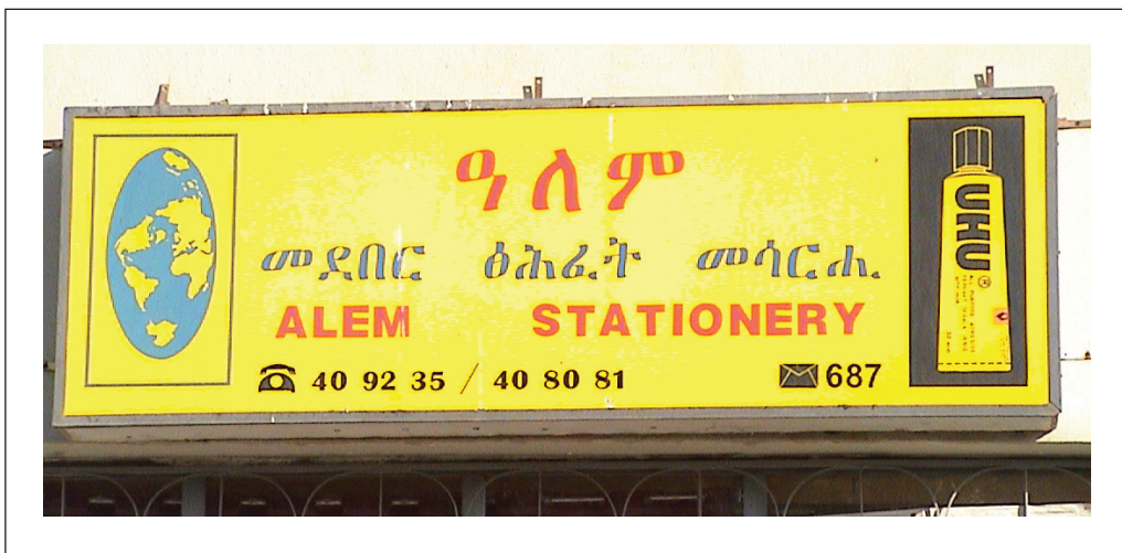
FIGURE 2 A stationery shop in Mekele

The influence and dominance of Amharic is not only at the surface level of the signs in the linguistic landscape,