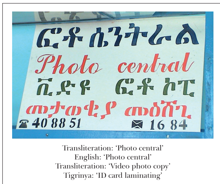
FIGURE 1 English, Tigrinya and transliteration (Lanza and Woldemariam 2008)

et al. 2011: 1); this analogy is applied to schoolbooks as well. Initially, we examine the texts that local shop owners write for their shop signs and then we examine educational textual materials, with language contact as the unit of analysis. The issue of language contact figures prominently in discussions of language change, which involves an innovation and the spread of that innovation. Whether features in a language can be considered contact-induced change or as having evolved through internal causes or developments within a language requires careful scrutiny not only from a synchronic perspective but also from a diachronic one, and there is debate in the literature (see Poplack and Levey 2009; Thomason 2011). Nonetheless in the Ethiopian context, an exploration into attested examples of purported language contact can provide the basis for further inquiry beyond structural description. Ethnographic observation has shown