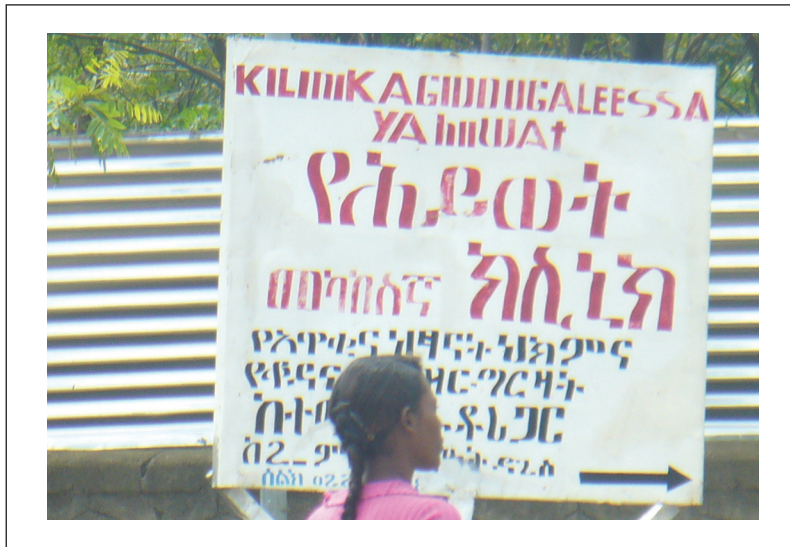
FIGURE 3 Amharic genitive marker ya used in an Oromo sign (NB Oromo with Latin alphabet at top of sign)