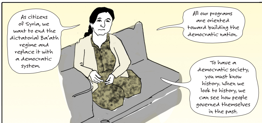
Figure 3: YPJ Academy, Hasakah, the election and education of women and men's defence force voluntary recruits, shared with permission of the author and publisher. 33