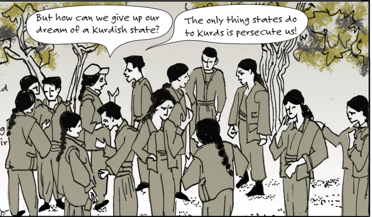
Figure 2: Abdullah Öcalan and Democratic Confederalism debated in PKK camps, shared with permission of the author and publisher. 15

The only thing states do to Kurds is persecute us!