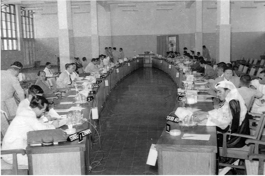
Figure 2: Conference attendees at work.

literatures of southern Africa and Southeast Asia together, the ‘decolonising camera’ does mark a contrast with the ‘colonising camera.’ However, like the postcolonial condition itself, it also reveals the entanglements of colonial and postcolonial image making and, as a result, the ways in which the colonial and the postcolonial both continue to haunt the present.