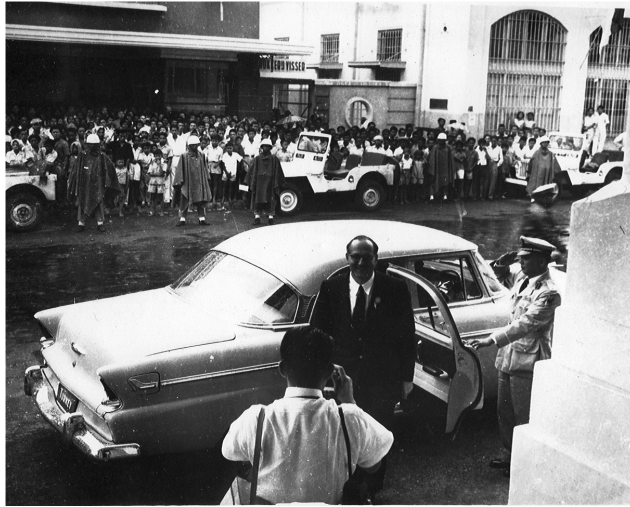
Figure 7: A delegate arriving at a venue (person and venue are unconfirmed).

traffic. The practice became more theatrical, however, with delegates proceeding as carefully spaced and self-contained national units (Figures 8 and 9). ‘World statesmen as key diplomatic actors are often perceived by audiences to be personifications of the states they represent,’ Shimazu describes, ‘hence, the giving of a strong stage performance becomes even more critical to creating a positive national image in international politics.’ 59 To this end, delegates wore clothing and uniforms that reflected cultural identities and political power. Indeed, despite the Third World solidarity being promoted, nationalism was on full display. Kojo Botsio (1916–2001), for example, who led the delegation from the Gold Coast, can be seen wearing Ghanaian kente cloth, while Zhou Enlai wore a Mao suit, popularised by the Chinese Communist Revolution. Nehru wore a Nehru jacket, naturally enough, and Nasser wore a military uniform symbolic of the Free Officers Movement, which he led to power in Egypt. As Shimazu comments, ‘[t]he spontaneity of the occasion produced powerful visual imagery of the great men of Asia and Africa striding purposefully towards the Freedom Building amidst cheering local crowds, and came to represent the iconography of the Bandung Conference in later years.’ 60