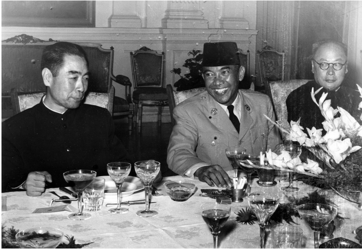
Figure 11: Zhou Enlai (left) and Sukarno (centre) at dinner.

Zhou survived an assassination attempt in Hong Kong on his way to Jakarta when the original Air India flight he was scheduled to fly on exploded. 68