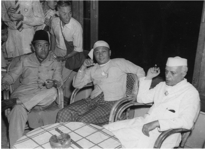
Figure 13: Ali Sastroamidjojo (left), Prime Minister U Nu (1907–95) of Burma (centre), and Nehru (right) during a break.

This excerpted passage also articulates what ultimately became the Bandung Spirit: a feeling of global political possibility when Asian and African countries collected their interests together. Richard Wright observed this elusive possibility, writing ‘[o]ver and beyond the waiting throngs that crowded the streets of Bandung, the Conference had a most profound influence upon the color-conscious millions in all the countries of the earth.’ 72 It can also be seen in the visual archive of Bandung with its depictions of convivial leaders and vibrant streets, which, to draw on Benjamin, contained traces of the future in terms of Third World solidarity and its limits.