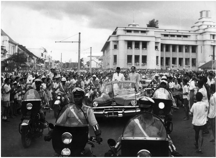
Figure 6: Zhou Enlai and Sukarno travel by motorcade.

delegates through hotel access and special waiting areas that allowed for viewing. 54 ‘In this way, pedestrians could enter the conference zone unhindered as long as they did not obstruct the delegates and the working of the conference,’ Shimazu writes. ‘This gesture of public spiritedness on the part of officialdom afforded once-in-a-lifetime opportunities to the people of Bandung to approach conference delegates face to face, and even ask for autographs.’ 55 This accommodation at the venues and on the streets, which can frequently be seen in images from the meeting (Figure 7), created ‘a special atmosphere to the whole occasion,’ allowing for ‘a continuous interaction between conference delegates and the people, almost as though a weeklong street theatre was being staged’. 56