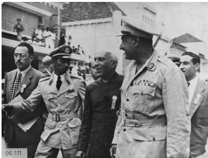
Figure 10: Nehru and Nasser walking the Bandung Walk.

around 40,000 (a 1945 estimate). Indonesia more generally had a substantial Chinese community, which encouraged the signing of the Sino-Indonesian Dual Nationality Treaty after the conference. 63 Reflecting his esteemed status as an elder statesman, Nehru was greeted by rallying cries of ‘Merdeka, pak!’ (‘Freedom, sir!’) when he waved to the crowds. In contrast, Nasser, given his younger age of only 37 years, was viewed as the embodiment of youthful vitality and ambitious revolutionary energy – he symbolised the new Egypt. 64 Indeed, the street photography genre of the images with their horizontal, anti-hierarchical nature emphasises once more a shared space with the crowds, as well as attempts at connection and solidarity among delegates (Figure 10). Seeking interpersonal and popular rapport are constant features. The conference offered a unique venue to build interpersonal and intergenerational networks among delegates. Unlike the UN with its American and Soviet supervision, the meeting actively excluded, at least formally, these superpower influences. The opportunity to meet, converse, and exchange ideas in person retained significant political value. In this way, the decolonising camera did illustrate a transfer of power – the postcolonial images from Bandung’s visual archive form a distinct contrast to the pathologising imagery of the colonising camera with its pejorative depictions of ‘native’ peoples unready to rule.