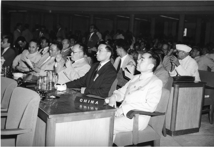
Figure 4: PRC Premier and Foreign Minister Zhou Enlai (right foreground) and other members of the Chinese delegation.

manner of speaking, a historical pageant, symbolizing the coming of the age of Asia and Africa. 40 Naoko Shimazu has reiterated this point more recently, describing the Bandung Conference as ‘a collective crowning ceremony or inauguration ceremony of post-colonial Asia and Africa.’ 41 As she further argues, a key reason for the early canonisation of Bandung can be attributed to its theatrical qualities of staging and enactment that immediately produced symbolic meanings during the event itself. ‘What is striking about Bandung is that it was an act of confident assertion vis-à-vis the [Western] ruling elite of international society,’ she writes, ‘and not a passive act of seeking acceptance.’ 42 The elements of stage (place), performers (political leaders), and audience (present and future) proved crucial to this radical assertion of an emergent Third Worldism. The photography from Bandung portrays the former two elements, while also building a present and future audience receptive to the ideals and spirit of Bandung through its spectacle.