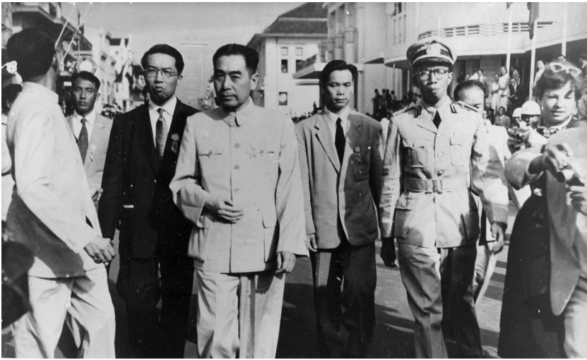
Figure 9: Zhou Enlai (centre left) and members of the PRC delegation.

most powerful leaders. 61 Nehru, Zhou, and Nasser were the most popular delegates among the street crowds, largely because they ‘embodied the power and the spirit of a nationalist or revolutionary struggle.’ 62 A specific reason for the appeal of Zhou was the presence of a significant local Chinese population in Bandung, numbering