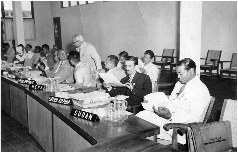
Figure 14: A working session with delegates from Sudan, Saudi Arabia, Nepal, and the Philippines.

Ariella Aisha Azoulay discusses how the institutionalisation of photography has depended on the identification of the photographer with an understanding that the image is their ‘property’. 74 This authorship is ‘the point of origin of the discussion of photography’. 75 However, against this prevalent practice, Azoulay argues for a suspension of the power of authorship – what she calls an ‘illegitimate sovereignty’ – in order to open the ‘event’ of a photograph to a wider political ontology beyond that of the photographer. 76 Jennifer Bajorek’s recent work in West Africa has extended Azoulay’s argument to examine multiple political ontologies and, following the lead of Patricia Hayes, the variety of forms of citizenship that can be documented and expressed through photographs. 77 As Bajorek and Hayes point out, Azoulay’s notion of ‘political ontology’ is circumscribed by normative understandings of citizenship and the nation-state – political framings that were suspended temporarily at Bandung in favour of Third World solidarity.