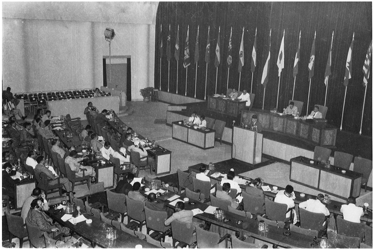
Figure 1: Major-General Sovag Jung Thapa of Nepal speaking before delegates.

would achieve its independence in 1956 and the Gold Coast (Ghana) in 1957 – the meeting initiated a new period of postcolonial diplomacy and Third World internationalism. It was the largest summit of its kind at that point, ostensibly representing 1.4 billion people, or almost two-thirds of the world’s population by some estimates. 1 Only the United Nations (UN), which had 76 members in 1955, was larger in numeric representation and in terms of geographic and political magnitude. Of the 29 delegations in attendance, 23 in total, including the five sponsors, represented countries on the Asian continent. These included the People’s Republic of China (PRC), Turkey, Japan, Lebanon, Jordan, Syria, Iran, Iraq, Saudi Arabia, Yemen, Afghanistan, Nepal, Laos, Cambodia, Thailand, North and South Vietnam, and the Philippines. The remaining deputations from Africa represented Egypt, Libya, Ethiopia, the Gold Coast, Sudan, and Liberia. 2