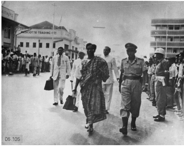
Figure 8: Kojo Botsio of the Gold Coast (foreground centre).