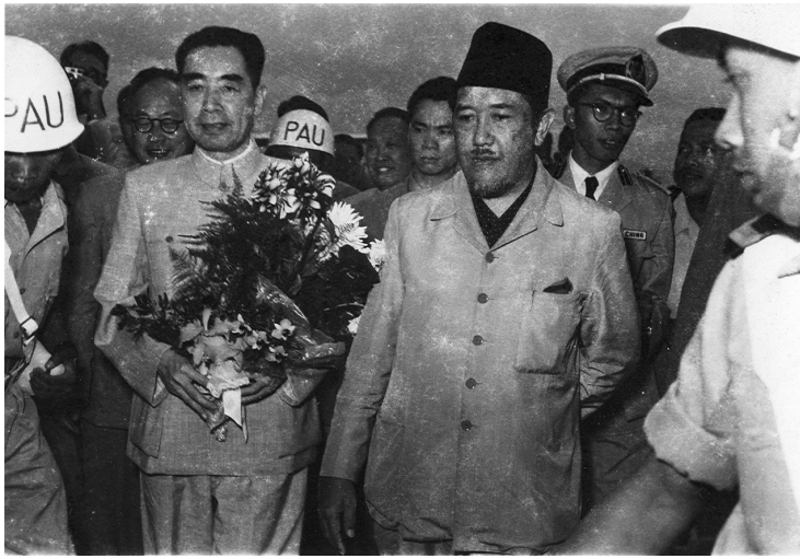
Figure 12: Zhou Enlai (left) arriving at Bandung's airport with Ali Sastroamidjojo (centre) welcoming him.

friendship with Nehru as indicated in the years ahead, particularly with the formation of the NAM in 1961.