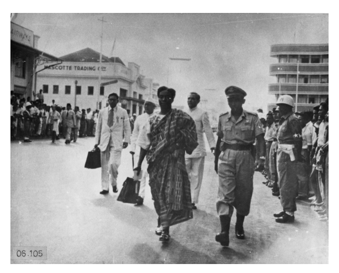
Figure 8: Kojo Botsio of the Gold Coast (foreground centre).