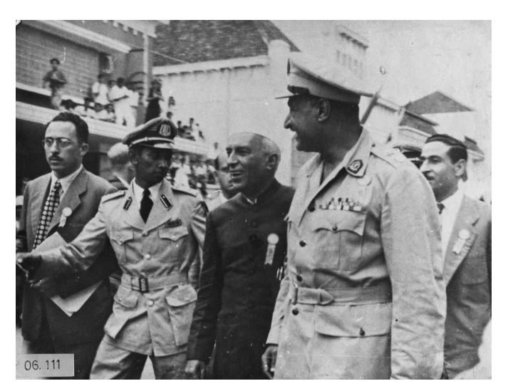
Figure 10: Nehru and Nasser walking the Bandung Walk.

around 40,000 (a 1945 estimate). Indonesia more generally had a substantial Chinese community, which encouraged the signing of the Sino-Indonesian Dual Nationality Treaty after the conference.<sup>63</sup> Reflecting his esteemed status as an elder statesman, Nehru was greeted by rallying cries of 'Merdeka, pak!' ('Freedom, sir!') when he waved to the crowds. In contrast, Nasser, given his younger age of only 37 years, was viewed as the embodiment of youthful vitality and ambitious revolutionary energy - he symbolised the new Egypt.<sup>64</sup> Indeed, the street photography genre of the images with their horizontal, anti-hierarchical nature emphasises once more a shared space with the crowds, as well as attempts at connection and solidarity among delegates (Figure 10). Seeking interpersonal and popular rapport are constant features. The conference offered a unique venue to build interpersonal and intergenerational networks among delegates. Unlike the UN with its American and Soviet supervision, the meeting actively excluded, at least formally, these superpower influences. The opportunity to meet, converse, and exchange ideas in person retained significant political value. In this way, the decolonising camera did illustrate a transfer of power - the postcolonial images from Bandung's visual archive form a distinct contrast to the pathologising imagery of the colonising camera with its pejorative depictions of 'native' peoples unready to rule.