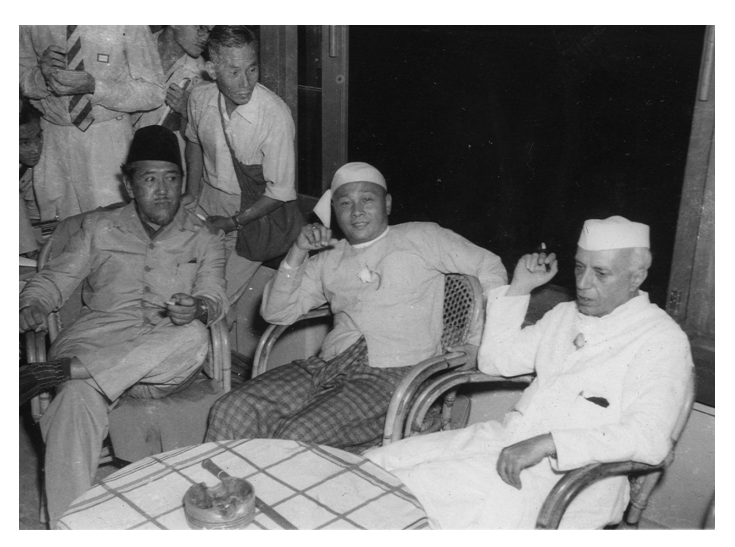
Figure 13: Ali Sastroamidjojo (left), Prime Minister U Nu (1907-95) of Burma (centre), and Nehru (right) during a break.

This excerpted passage also articulates what ultimately became the Bandung Spirit: a feeling of global political possibility when Asian and African countries collected their interests together. Richard Wright observed this elusive possibility, writing '[o]ver and beyond the waiting throngs that crowded the streets of Bandung, the Conference had a most profound influence upon the color-conscious millions in all the countries of the earth.<sup>72</sup> It can also be seen in the visual archive of Bandung with its depictions of convivial leaders and vibrant streets, which, to draw on Benjamin, contained traces of the future in terms of Third World solidarity and its limits.