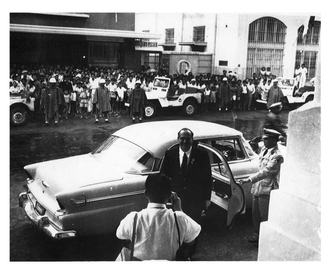
Figure 7: A delegate arriving at a venue (person and venue are unconfirmed).

traffic. The practice became more theatrical, however, with delegates proceeding as carefully spaced and self-contained national units (Figures 8 and 9). 'World statesmen as key diplomatic actors are often perceived by audiences to be personifications of the states they represent, Shimazu describes, 'hence, the giving of a strong stage performance becomes even more critical to creating a positive national image in international politics.'59 To this end, delegates wore clothing and uniforms that reflected cultural identities and political power. Indeed, despite the Third World solidarity being promoted, nationalism was on full display. Kojo Botsio (1916–2001), for example, who led the delegation from the Gold Coast, can be seen wearing Ghanaian kente cloth, while Zhou Enlai wore a Mao suit, popularised by the Chinese Communist Revolution. Nehru wore a Nehru jacket, naturally enough, and Nasser wore a military uniform symbolic of the Free Officers Movement, which he led to power in Egypt. As Shimazu comments, '[t]he spontaneity of the occasion produced powerful visual imagery of the great men of Asia and Africa striding purposefully towards the Freedom Building amidst cheering local crowds, and came to represent the iconography of the Bandung Conference in later years.<sup>60</sup>