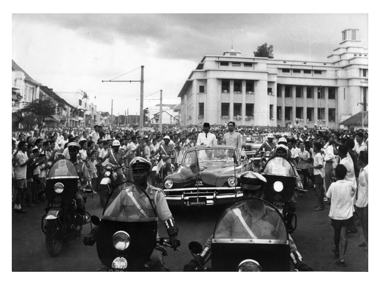
Figure 6: Zhou Enlai and Sukarno travel by motorcade.

delegates through hotel access and special waiting areas that allowed for viewing. 54 'In this way, pedestrians could enter the conference zone unhindered as long as they did not obstruct the delegates and the working of the conference,' Shimazu writes. 'This gesture of public spiritedness on the part of officialdom afforded once-in-a-lifetime opportunities to the people of Bandung to approach conference delegates face to face, and even ask for autographs.'55 This accommodation at the venues and on the streets, which can frequently be seen in images from the meeting (Figure 7), created 'a special atmosphere to the whole occasion, allowing for 'a continuous interaction between conference delegates and the people, almost as though a weeklong street theatre was being staged'.56