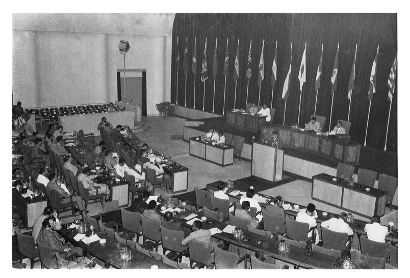
Figure 1: Major-General Sovag Jung Thapa of Nepal speaking before delegates.

would achieve its independence in 1956 and the Gold Coast (Ghana) in 1957 - the meeting initiated a new period of postcolonial diplomacy and Third World internationalism. It was the largest summit of its kind at that point, ostensibly representing 1.4 billion people, or almost two-thirds of the world's population by some estimates.<sup>1</sup> Only the United Nations (UN), which had 76 members in 1955, was larger in numeric representation and in terms of geographic and political magnitude. Of the 29 delegations in attendance, 23 in total, including the five sponsors, represented countries on the Asian continent. These included the People's Republic of China (PRC), Turkey, Japan, Lebanon, Jordan, Syria, Iran, Iraq, Saudi Arabia, Yemen, Afghanistan, Nepal, Laos, Cambodia, Thailand, North and South Vietnam, and the Philippines. The remaining deputations from Africa represented Egypt, Libya, Ethiopia, the Gold Coast, Sudan, and Liberia.<sup>2</sup>