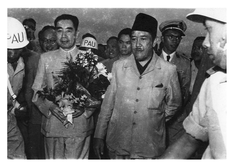
Figure 12: Zhou Enlai (left) arriving at Bandung's airport with Ali Sastroamidjojo (centre) welcoming him.

friendship with Nehru as indicated in the years ahead, particularly with the formation of the NAM in 1961.