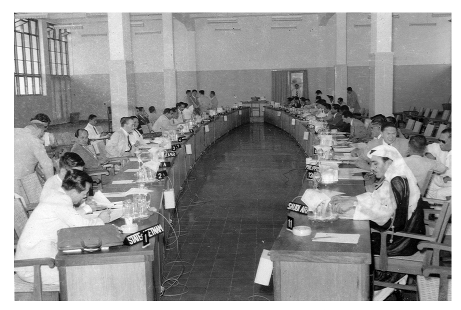
Figure 2: Conference attendees at work.

literatures of southern Africa and Southeast Asia together, the 'decolonising camera' does mark a contrast with the 'colonising camera'. However, like the postcolonial condition itself, it also reveals the entanglements of colonial and postcolonial image making and, as a result, the ways in which the colonial and the postcolonial both continue to haunt the present.