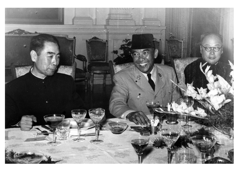
Figure 11: Zhou Enlai (left) and Sukarno (centre) at dinner.

Zhou survived an assassination attempt in Hong Kong on his way to Jakarta when the original Air India flight he was scheduled to fly on exploded.<sup>68</sup>