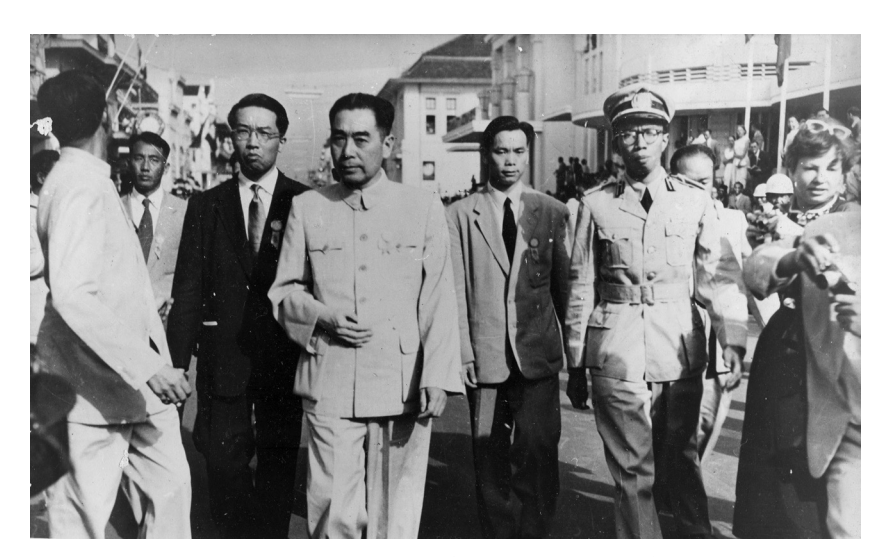
Figure 9: Zhou Enlai (centre left) and members of the PRC delegation.

most powerful leaders.<sup>61</sup> Nehru, Zhou, and Nasser were the most popular delegates among the street crowds, largely because they 'embodied the power and the spirit of a nationalist or revolutionary struggle'.62 A specific reason for the appeal of Zhou was the presence of a significant local Chinese population in Bandung, numbering