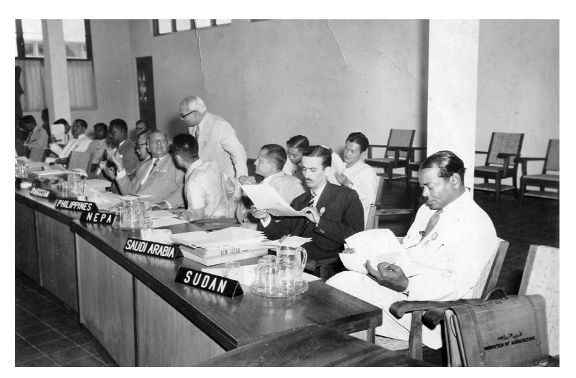
Figure 14: A working session with delegates from Sudan, Saudi Arabia, Nepal, and the Philippines.

Ariella Aïsha Azoulay discusses how the institutionalisation of photography has depended on the identification of the photographer with an understanding that the image is their 'property'. This authorship is 'the point of origin of the discussion of photography.75 However, against this prevalent practice, Azoulay argues for a suspension of the power of authorship - what she calls an 'illegitimate sovereignty' - in order to open the 'event' of a photograph to a wider political ontology beyond that of the photographer.<sup>76</sup> Jennifer Bajorek's recent work in West Africa has extended Azoulay's argument to examine multiple political ontologies and, following the lead of Patricia Hayes, the variety of forms of citizenship that can be documented and expressed through photographs.<sup>77</sup> As Bajorek and Hayes point out, Azoulay's notion of 'political ontology' is circumscribed by normative understandings of citizenship and the nation-state - political framings that were suspended temporarily at Bandung in favour of Third World solidarity.