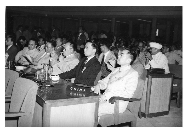
Figure 4: PRC Premier and Foreign Minister Zhou Enlai (right foreground) and other members of the Chinese delegation.

manner of speaking, a historical pageant, symbolizing the coming of the age of Asia and Africa. Naoko Shimazu has reiterated this point more recently, describing the Bandung Conference as 'a collective crowning ceremony or inauguration ceremony of post-colonial Asia and Africa. As she further argues, a key reason for the early canonisation of Bandung can be attributed to its theatrical qualities of staging and enactment that immediately produced symbolic meanings during the event itself. What is striking about Bandung is that it was an act of confident assertion vis-à-vis the [Western] ruling elite of international society, she writes, and not a passive act of seeking acceptance. The elements of stage (place), performers (political leaders), and audience (present and future) proved crucial to this radical assertion of an emergent Third Worldism. The photography from Bandung portrays the former two elements, while also building a present and future audience receptive to the ideals and spirit of Bandung through its spectacle.