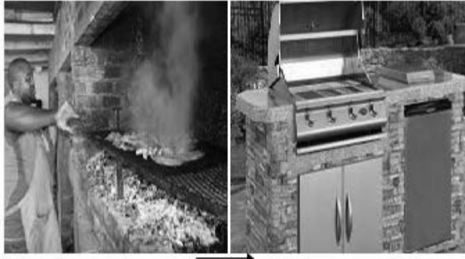
Picture 1: It highlights a need to transit from the excessive use of coal, to LPG for braai activities, for example.

Picture 2 below shows incandescent lights and solar LED lights.