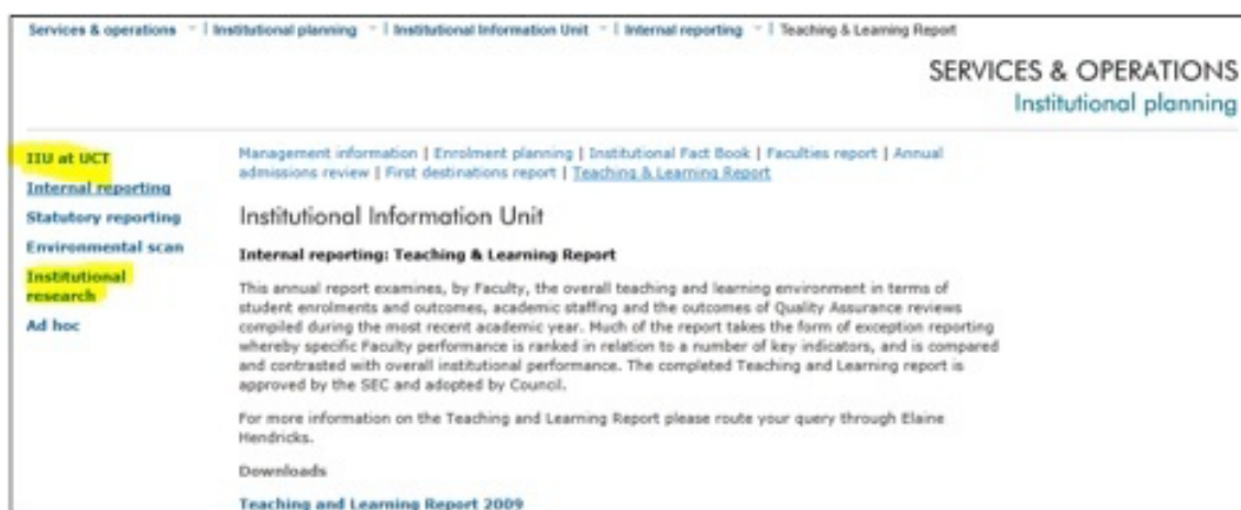
Figure 2: http://www.uct.ac.za/services/ip/iu/reporting/teaching/ [17 August 2011]

The official UCT Annual Teaching and Learning Reports are conspicuous by their absence up until three clicks down from the homepage and their location is not intuitive. These documents fall outside the remit of this paper as, unlike the UCT Annual Research Reports which are available three clicks down on the Research Office website, the Teaching and Learning Reports are buried inside the Institutional Planning Unit website (See Figure 2) on the fifth click down accessed via the homepage tab labelled ‘Services and Operations’.