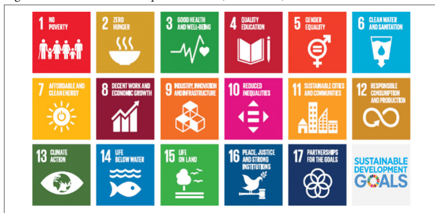
Figure 2: Sustainable Development Goals (2015–2030)