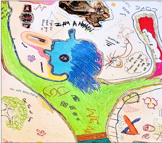
Artwork created by the group of young women

As the artwork shows, this space gave the young women a platform from which to recognize and value their uniqueness as their beauty, to articulate the power that they have to fight for what they believe in, and to establish that others do not have the power to change who they are. This transition from personal expression in the visual storybook work, to nonverbal dialogue through movement, to a collective articulation of self and identity was a powerful way of building trust in others, to understand the connections between bodies, lived experiences and aspirations for change. The body map presents evidence concrete example of this important transition.