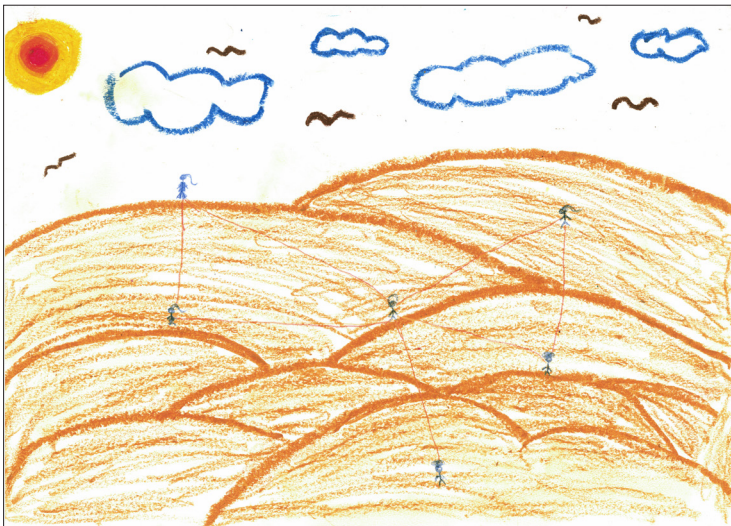
Artwork by young woman aged 17