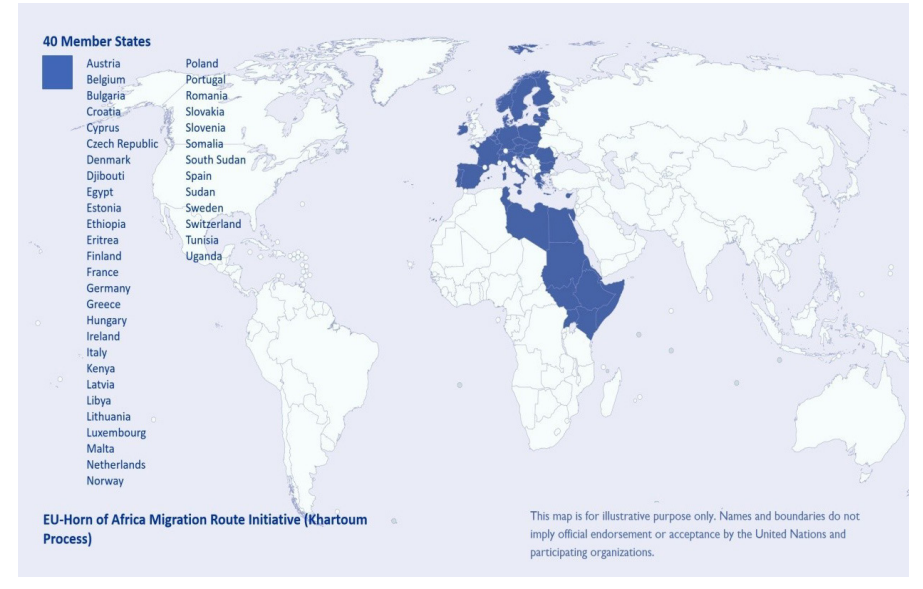
Figure 4: Map of the Khartoum Process countries

the initiative focuses on addressing human trafficking and migrant smuggling from and through the Horn of Africa and East and North Africa to Europe (see Figure 4).